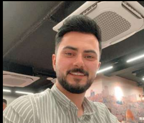
★ Alaa Damo 24 HOURS

A panicked Karim wakes up wrapped in a white shroud. The film pieces together memories from the night before.