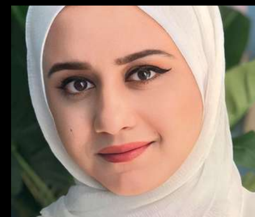
★ Neda'a Abu Hassnah OUT OF FRAME

A juxtaposition of video, photography, and paintings intercut with an artist working on a painting that is completed at the end of the film.