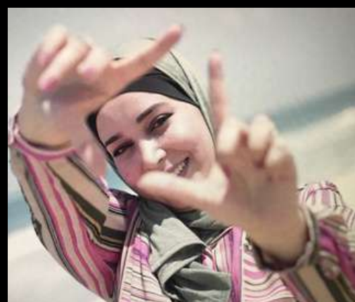
★ Hana Eleiwa NO

A filmmaker's journey to find a moment of joy in the midst of unimaginable destruction, death and loss in Gaza.